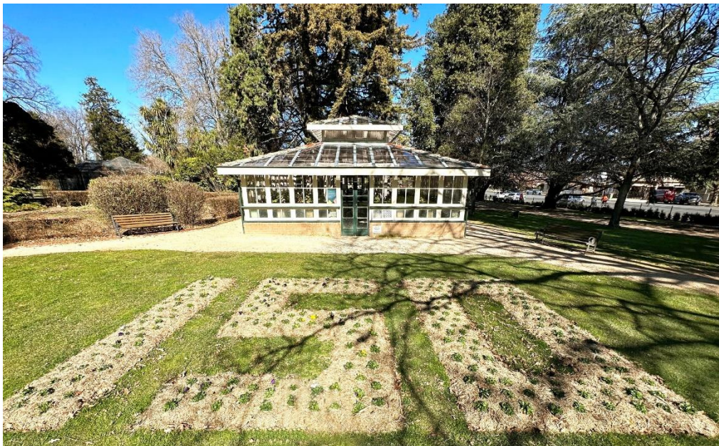
A special garden bed has been prepared for Cook Park's 150th celebrations

"Cook Park and the country that it occupies has played host to many significant moments for generations of Orange families," Cr Hamling said. "From community events and family occasions to a casual picnic or quiet stroll, Cook Park holds many fond memories for the city's residents."