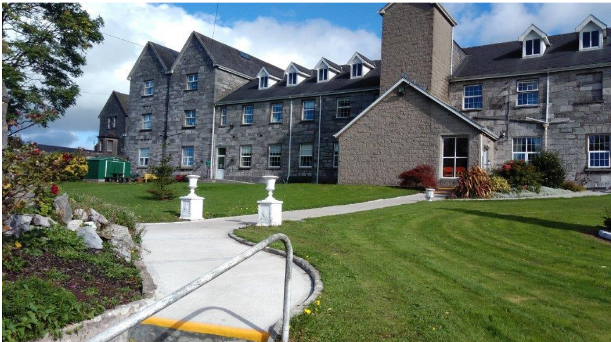
Midleton Community Hospital showing buildings from Midleton Workhouse